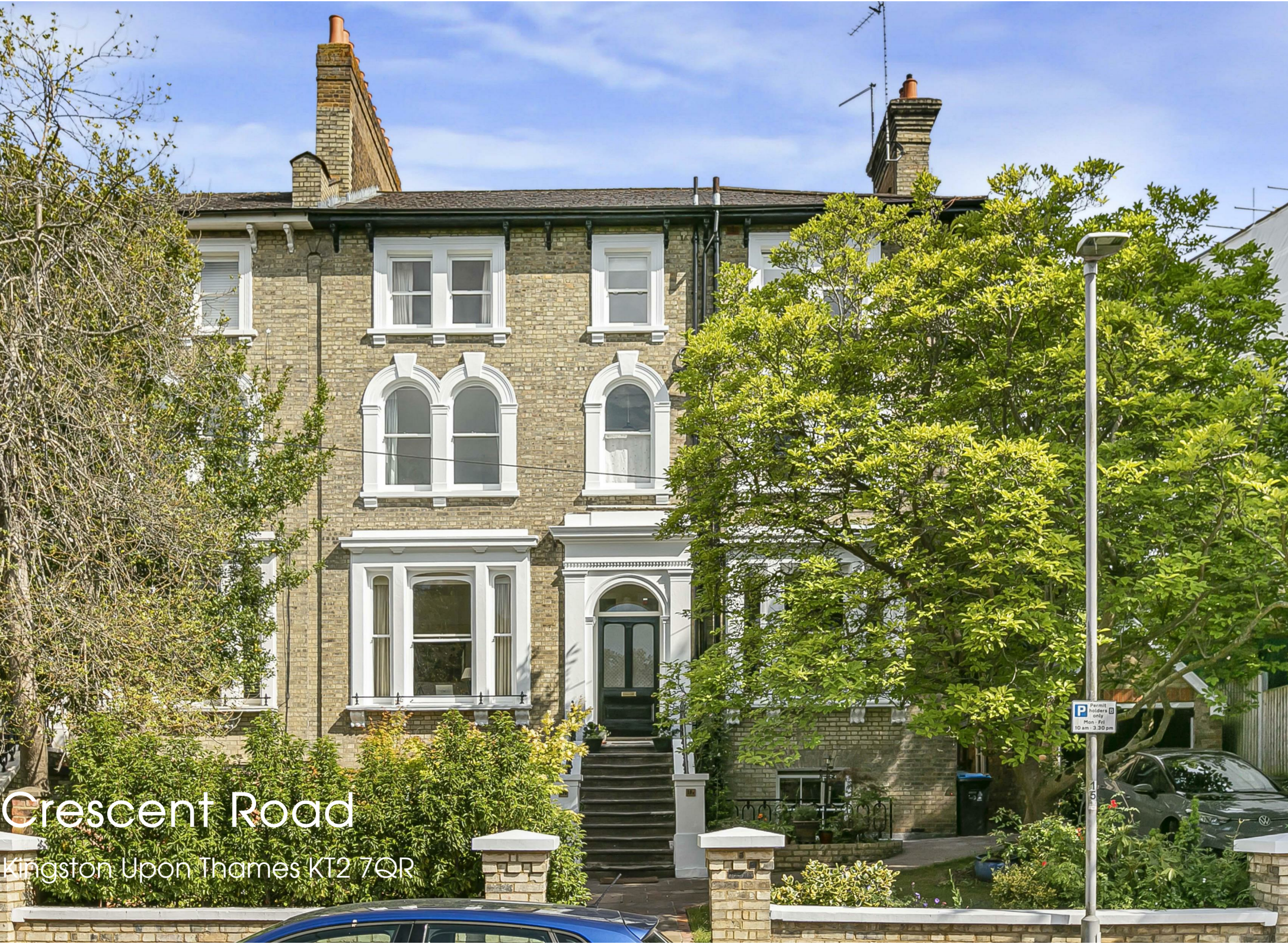
Crescent Road Kingston Upon Thames KT2 7QR